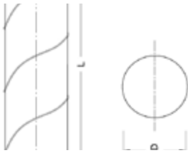
Tolerance for spiral duct